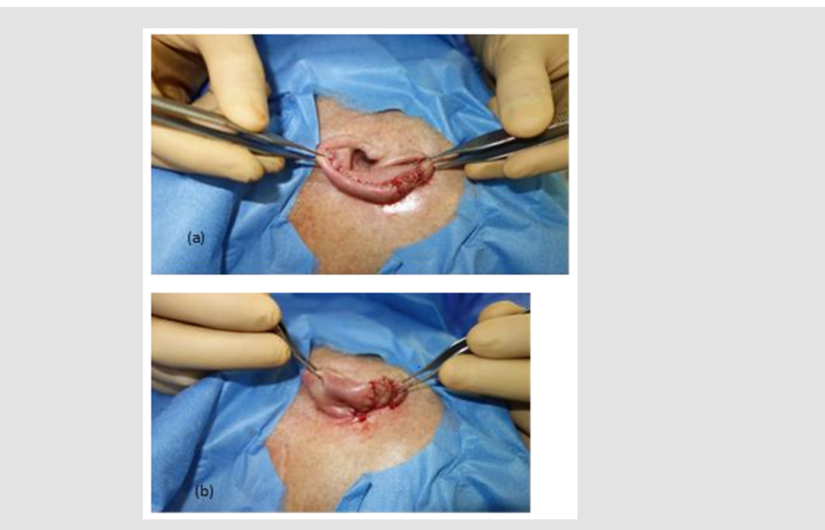
Figure 4: The surgical results are seen immediately after reconstruction: anterior (a) and posterior (b) aspect.

which was designed by the author in collaboration with a clinical psychologist (Table 1). This questionnaire likely aimed to assess the patients' satisfaction and outcomes after the surgery, including their cosmetic results and overall experience with the modified Antia-Buch technique [18,19]. The evaluative questionnaire used in the study consists of several scales to assess different aspects of the patients' experiences and outcomes after ear reconstruction using the modified Antia-Buch technique.