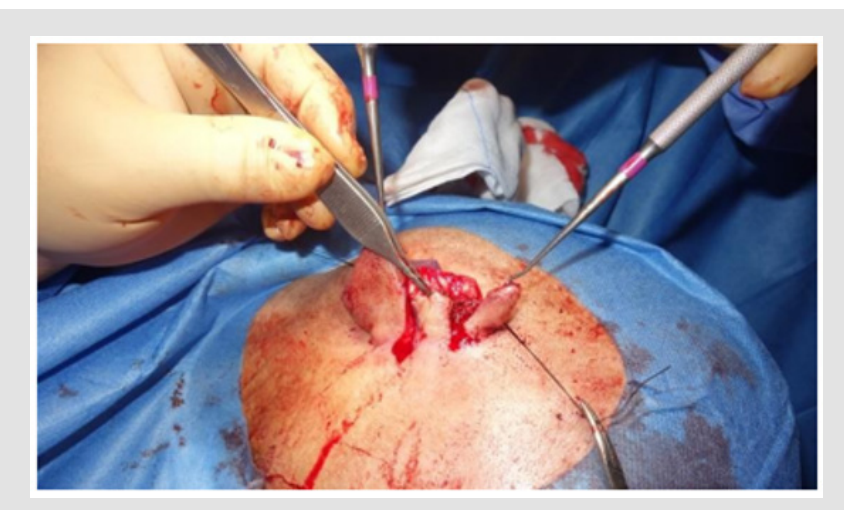
Figure 3: The lesion was surgically removed, and a retroauricular skin flap was raised.

The retroauricular advancement flaps are utilized to aid in the closure of the defect without the need for resecting the scapha. By utilizing these flaps, the surgeons can achieve effective coverage of the chondrocutaneous defect while preserving the natural anatomy of the ear (Figure 4). Regarding the follow-up process, patients either attended an in-person appointment or were contacted by telephone for a postoperative survey. Those who underwent the modified Antia-Buch approach were asked to complete an evaluative questionnaire,