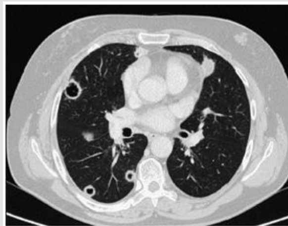
Figure 2: Chest computed axial tomography showing multiple cavitated lesions.