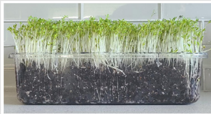
Figure 1: Fast growing garden cress seeds within six days from planting (Height = 7 cm).

disc. Several modifications such as a variety of disc material, sample concentrations, disc paper, and temperature and humidity variables were applied (Figure 1).