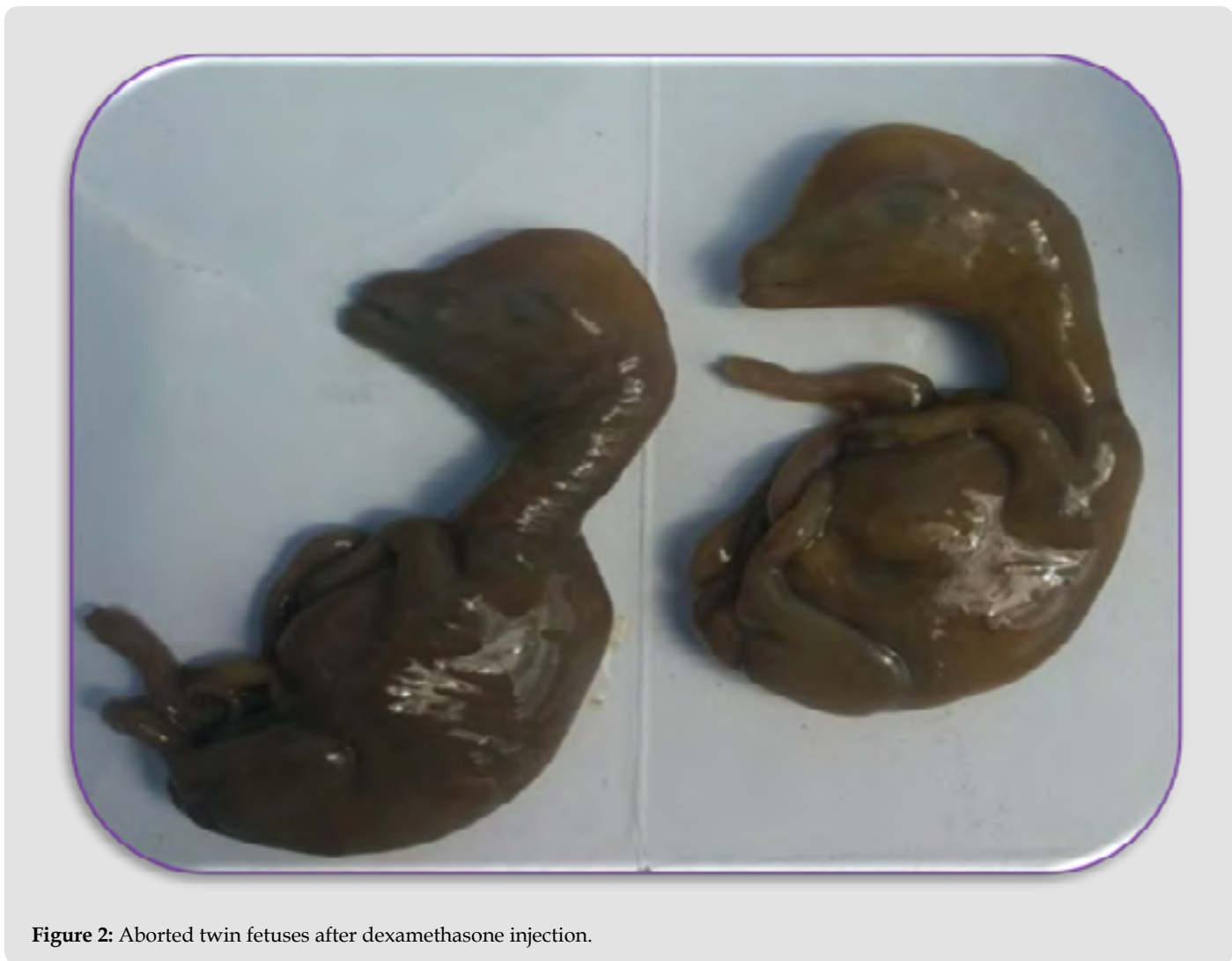
Figure 2: Aborted twin fetuses after dexamethasone injection.