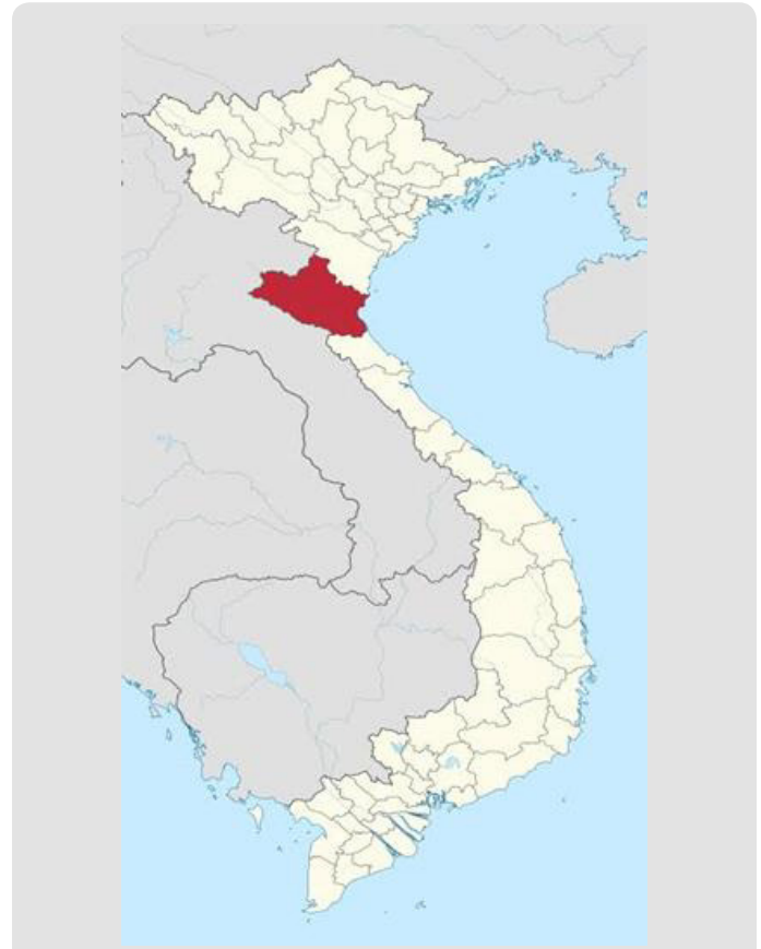
Figure 1: Location of Nghe An province in Viet Nam.

We used the following equation to calculate the age-standardized mortality rate: