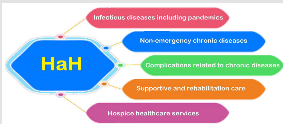
Figure 2: The development of home-based healthcare and potential spectrum of HaH.

In fact, the healthcare at home (HaH) can be modelled on lines of the hospice care as a multidisciplinary team approach, generally home-based and sometimes providing services through freestanding facilities, in nursing homes, or within hospitals for handling potentially treatable conditions such as pneumonia, heart failure, and alike, with brief hospital stays if necessary (Figure 2).