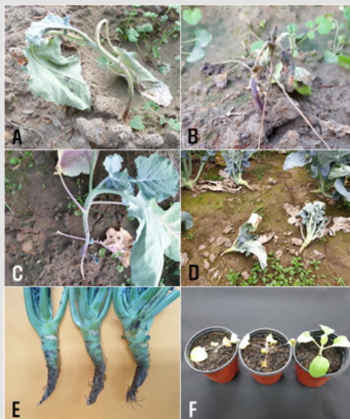
Figure 1: Basal stem rot symptoms of broccoli plants.

Basal stem rot symptoms were frequently observed on broccoli plants grown in the fields investigated. The symptoms began on the plant parts at the soil surface. The diseased plants wilted and blighted in the early stage of the plant growth (Figures 1A & 1B). The basal stem of the infected plant receded and was thin, discolored, and rotten (Figure 1C). The diseased plants were retarded in their growth and fell down in the medium stage of the plant growth (Figure 1D). The basal stems of the diseased plants turned dark brown and rotten (Figure 1E). The incidence of diseased plants in the fields investigated at two locations in Korea during the disease surveys was 1-10% (Table 1).