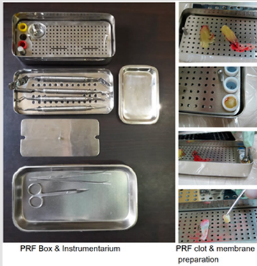
Figure 2: A set of PRF Box with Instruments. Step by step fabrication of Platelet-Rich Fibrin (PRF) clot & membrane.