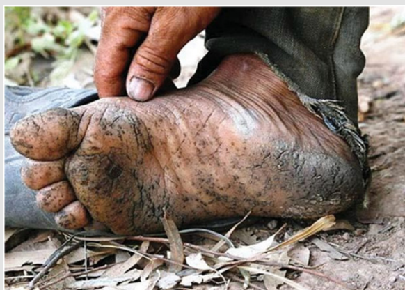
Figure 3: Skinlesions due to arsenicosis(adaptedfrom[36]).

However, information contained in the Risk Assessment Information System database states “The acute lethal dose of inorganic arsenic to humans has been estimated to be about 0.6