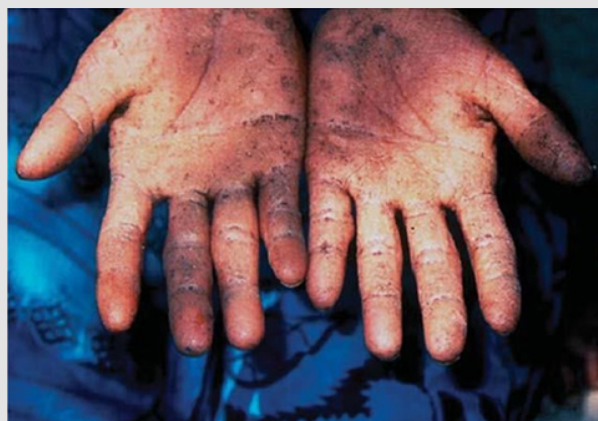
Figure 1: Arsenickeratosis[23].

Arsenic is a protoplasmic toxicant that primarily affects the sulphhydryl group of cells and compromised the integrity of cell enzymes and cellular respiration [8]. During chronic arsenic exposure, harmful inorganic arsenic compounds are enzymatically methylated by humans and organisms (fungi, bacteria, and algae) to produce less harmful Monomethylarsonic Acid (MMA) and Dimethylarsinic Acid (DMA) and are which excreted through urine. These end products are considered reliable biomarker of chronic arsenic exposure [23]. However, Pigmentation and keratosis (Figure 1) are the specific skin lesions that indicate chronic arsenic toxicity [24]. The biotransformation occurs primarily in the liver, a reaction catalysed by S-adenosylmethionine (SAM) and Glutathione (GSH)/ NADPH dependent hepatic methyltransferases [25]. The methyl group is donated by S-adenosylmethionine (SAM) while the Glutathione (GSH) serves as the redundant [26,27]. However, other tissues such as heart, lung, bladder and kidney, and bladder have also reported for the expression of folate dependent methyltransferases [25]. Therefore, the binding of arsenic species to GSH enhanced the success of the biotransformation and increases its elimination from the body.