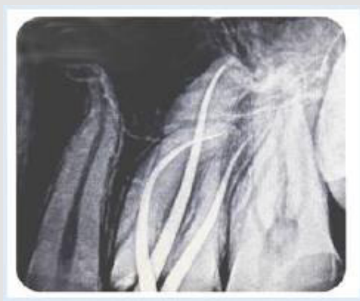
Figure 3: IOPA Radiograph of 26 following RCT.