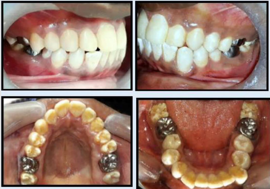
Figure 4: Postoperative appearance of the dentition.