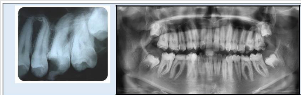
Figure 1: Preoperative radiographs.

inheritance”. Preventive care was provided and all the teeth which had caries extending to dentine were restored with Composite resin. Root canal treatment of 26 was completed in a single visit (Figure 3). All permanent first molars received Stainless Steel Crown (SSC). Direct veneering with composite resin was performed up to second premolar teeth in the upper and lower arches (Figure 4).