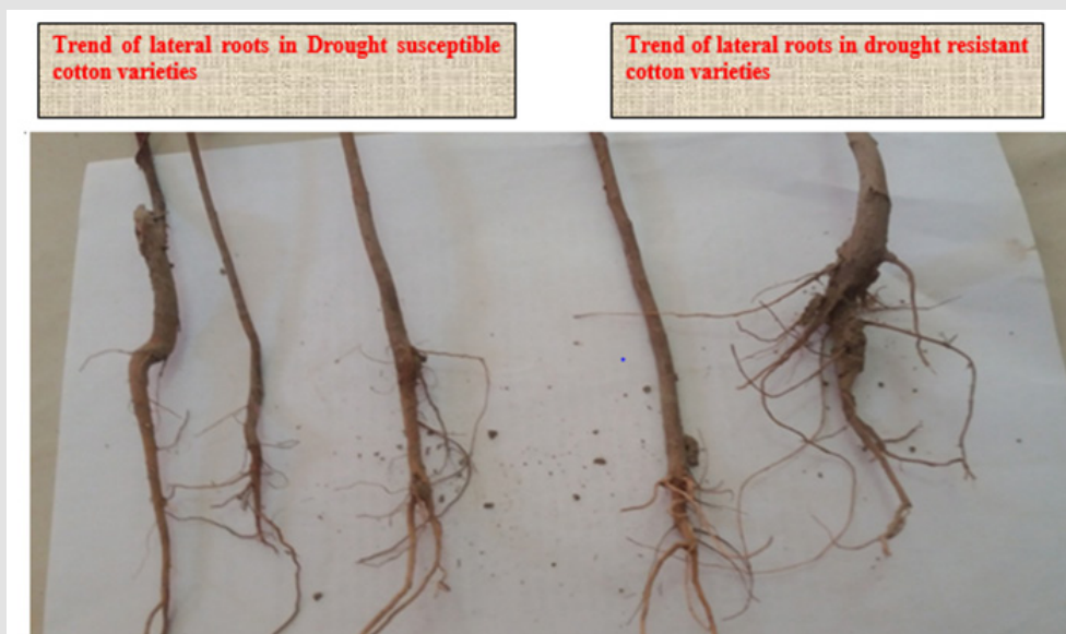
Figure 1: Trend of lateral root architecture in drought resistant and drought susceptible cotton varieties.