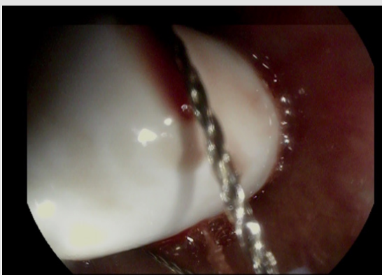
Figure 2: The extraction of the capsule from the Zenker diverticulum.