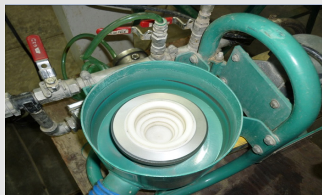
Figure 3: Interior of the Knelson Concentrator Cone.