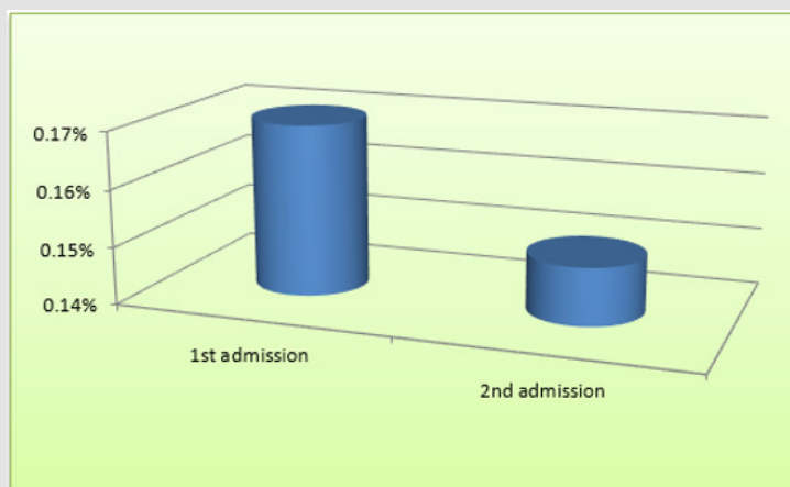
Figure 2: Graphic illustration of first and recurrent admissions' suicidal behavior.