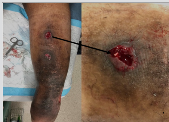
Figure 1: Left panel shows wounds on the calf following Venaseal ablation and glue cast is visible on the wounds overlying the LSV. Right panel is a close-up of the wound showing a frond of CAG protruding from the underlying great saphenous vein.

sound scan at 12 months showed that both GSV and SSV remained completely ablated (Figure 3). Patient remained asymptomatic from his treated CVI.