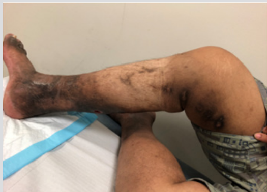
Figure 2: Multiple healed wounds along the distribution of GSV. Those wounds were extruding glue casts and took about 8 months to heal completely.