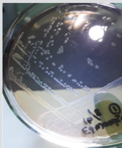
Figure 1b: The colony were small, transparent and punctate.