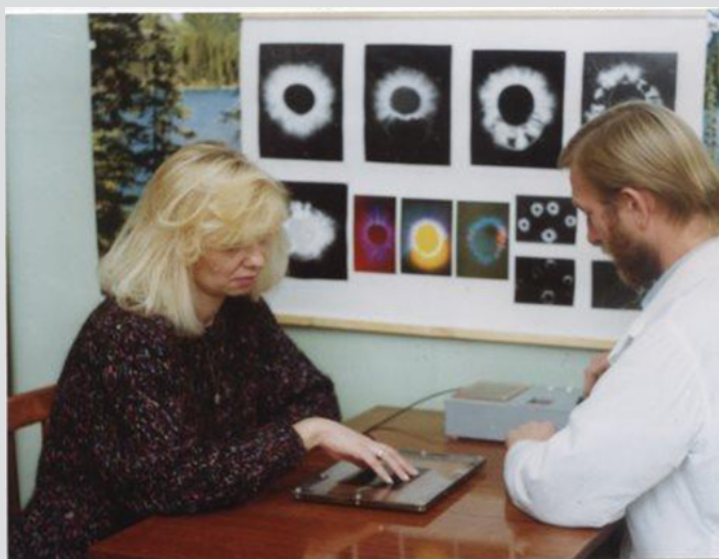
Figure 2: Bio diagnostics.

- 0.9 hertz; *flash of rage - 0.5 hertz; anger- 1.4 hertz; *arrogance - 0.8 hertz; pride -3.1 hertz; *neglect -1.5 hertz; *superiority -1.9 hertz; *pity -3 hertz. Researchers on physical medicine noticed long ago that positive people who lead a healthy lifestyle are not ill when the frequency of vibrations of their power field was included into a resonance with a frequency of vibrations of 8 hertz. Throughout the millennia the frequency of vibrations (fluctuations in a second) our planet was 7.8-8.2 Hz. Physicists call it Schuman's frequency. It fluctuates within 8 hertz. The resonance of standing electromagnetic waves with a frequency of 8 hertz of a biofield provides and supports a healthy condition of an organism. Health to the person is provided by the clean nature and spiritual and naturalistic practice of a healthy lifestyle [5].