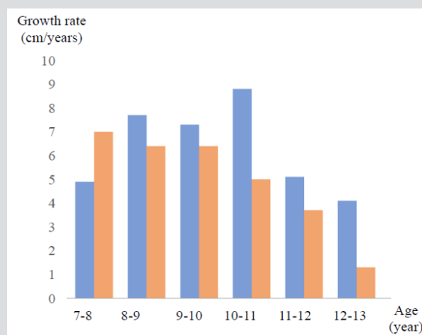
Figure 2: Comparison of the growth rates between Case1 and Case 2.

Note: Blue bars indicate the growth rates in Case 1, and red bars indicate that in Case 2.