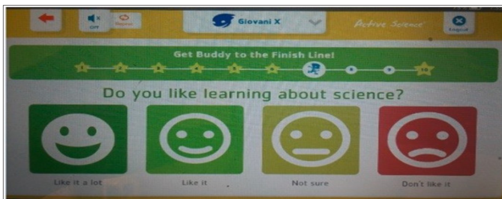
Figure 2: Measurement of beginning perception of Science.