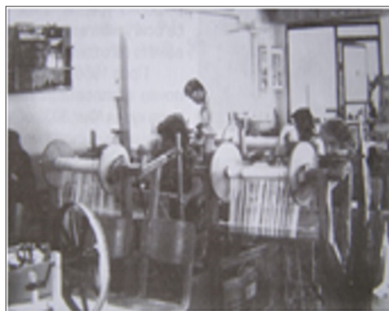
Figure 1: A few large premises are furnished and equipped for carpentry shop, spinning and weaving shop, workshop for paper, leather, yarn and threads.

Labour therapy (LT) is a branch of the physical and rehabilitation medicine and due to its specifics has been established as a separate method of treatment. LT means exercise in the form of work activities with treatment purposes. The significance of LT for restoring patient's independent life and full work capacity is indisputable. The treatment through work activities supports functional, physical and psychic rehabilitation of the patient, improved psychological and emotional state, stimulates patient's desire to participate actively in the rehabilitation process. The fact that the first described treatments through work activities are connected to treatment of psychiatric disorders expressively points out its psychiatric and therapeutic significance.