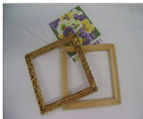
Figure 5: The work with wood includes manufacturing painting frames, fire-writing on souvenirs, processing plywood.

In 2004 the Medical University of Pleven opened a new academic specialty - Medical Rehabilitation and Ergotherapy, and