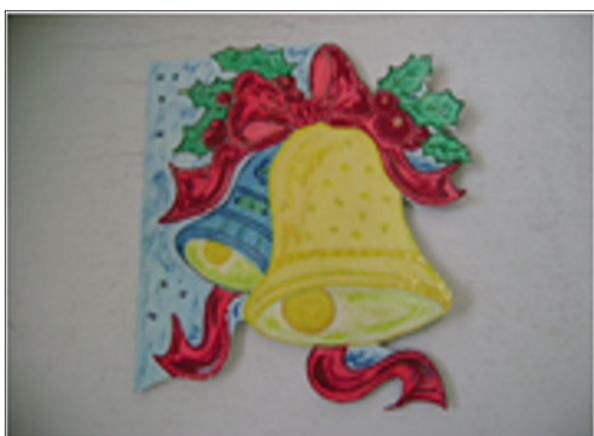
Figure 2: The work with paper includes making cards using the quilling technique, folding paper as in origami, papier mache technique, decoupage technique, cutting and applying decorative elements, weaving items from paper rods and other.

[1]. Occupational therapy deals mainly with everyday life issues of patients with permanent locomotor and psychiatric disorders. Training and re-training for everyday life activities for people with such disorders is of crucial importance for improving and facilitating their life. For each patient the most important matter is self-service - personal hygiene, dressing, feeding, various home activities [2]. Object of current article is to share experience of the Clinic of Physical and Rehabilitation Medicine at the University Hospital - Pleven, in the field of labour therapy and occupational therapy as a part of complete rehabilitation of patients suffering various locomotor and mental disorders. The labour therapy and occupational therapy Service at the University Hospital is established in 1965 by the founder of the physiotherapy in the Pleven hospital, Dr. Rusi Rusev, MD. A few large premises are furnished and equipped for carpentry shop, spinning and weaving shop, workshop for paper, leather, yarn and threads [3] (Figure 1).