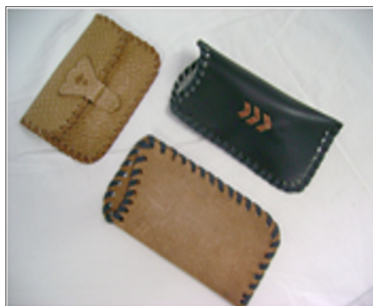
Figure 4: The work with leather includes manufacturing items from leather – glass cases, purses, book clips, book binds and folder binds, jewelry.

therefore expanded and rich work in Labour therapy- Sector is required, in order to conduct seminars and clinical practice for the students. Rehabilitative labour therapy or the so-called functional work therapy has the central place in the Service [1]. Its direct purpose is to influence the locomotor deficit in certain joints, limbs or system. Various activities and work with different materials are very useful [4]. The work with paper includes making cards using the quilling technique, folding paper as in origami, papier mache technique, decoupage technique, cutting and applying decorative elements, weaving items from paper rods and other (Figure 2). When working with yarn and textile materials (yarns, threads, pack-threads, fabric) various items are being knitted or crocheted; the patients embroider using embroidery frame, tie macramé, apply the ajour technique, weave on horizontals or vertical loom or weaving frame (Figure 3). The work with leather includes manufacturing items from leather – glass cases, purses, book clips, book binds and folder binds, jewelry (Figure 4).