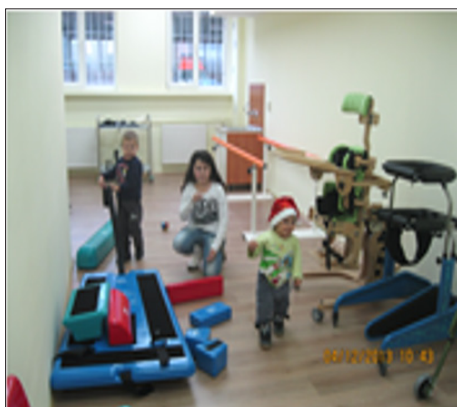
Figure 7: For older children are used various activities from school lessons in Domestic Skills and Techniques and Arts.