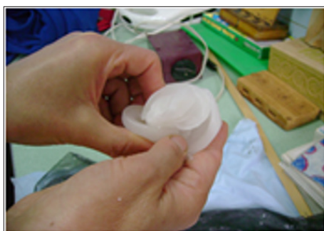
Figure 6: When working with plastic materials the easiest to find and use is the bread dough, also fondant dough for making small figures and decoration of confectionary. Available and easy to work with, especially for children, is the plasticine or potter's clay.

decoration of confectionary. Available and easy to work with, especially for children, is the plasticine or potter's clay (Figure 6). During the years a work therapy for patients in children age has been developed, called game therapy. It is designated mainly to support the general psychological and physical development of children in certain age and to prevent permanent disability. Various toys are appropriate, to support and improve hand grip, moving objects are used to stimulate initial walking skills, games with imitation; for older children are used various activities from school lessons in Domestic Skills and Techniques and Arts (Figures 7 & 8).