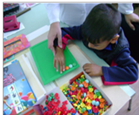
Figure 8: For older children are used various activities from school lessons in Domestic Skills and Techniques and Arts.