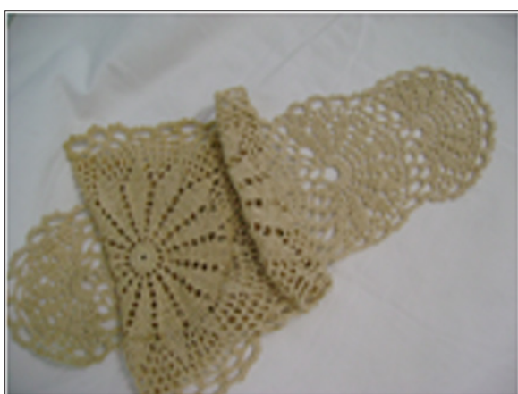
Figure 3: The patients embroider using embroidery frame, tie macramé, apply the ajour technique, weave on horizontals or vertical loom or weaving frame.