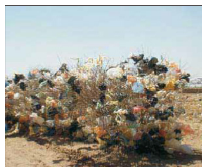
Figure 2: Wind-blown litter is an endemic problem in the countryside around major towns in northern and central Sudan.

The conceptualization of Smart City, therefore, varies from city to city and country to country, depending on the level of development, willingness to change and reform, resources and aspirations of the city residents. A smart city would have a different connotation in India than, say, Europe. es that drive growth and prosperity. In this paper an approach to smart waste collection is proposed able to improve and optimize the handling of solid waste [2]. “Smart city” is one such use went for upgrading the lifestyle of individuals. One of the real obstacles in numerous urban groups is its strong waste administration, and compelling administration of the strong waste created transforms into a principal part of a savvy city [4] (Figures 1 & 2).