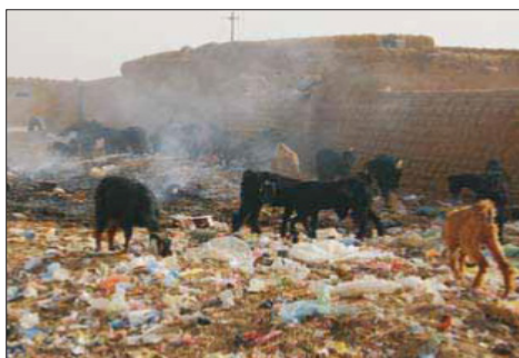
Figure 1: Open air burning is the most common method of waste disposal in IDP settlements such as this one on the southern fringe of Khartoum.

The conceptualization of Smart City, therefore, varies from city to city and country to country, depending on the level of development, willingness to change and reform, resources and aspirations of the city residents. A smart city would have a different connotation in India than, say, Europe. es that drive growth and prosperity. In this paper an approach to smart waste collection is proposed able to improve and optimize the handling of solid waste [2]. “Smart city” is one such use went for upgrading the lifestyle of individuals. One of the real obstacles in numerous urban groups is its strong waste administration, and compelling administration of the strong waste created transforms into a principal part of a savvy city [4] (Figures 1 & 2).