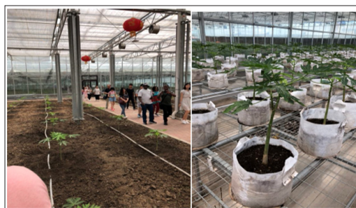
Figure 6: On left side an instruction from teacher about soil, plants and irrigation system, on the right sides different plants are planted in plastic bags with new technology.