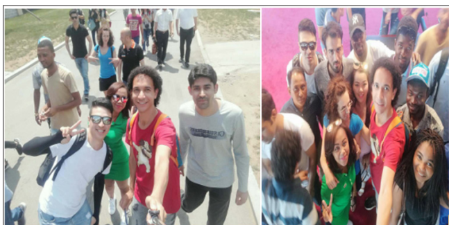
Figure 1: Ghonimy from Egypt while taking picture with other country mates.

During the trip the students from different countries enjoying their self while taking pictures and capturing their memories (Figures 1-6).