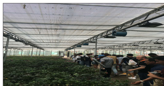
Figure 4: A greenhouse visit (different crop raising in different conditions).