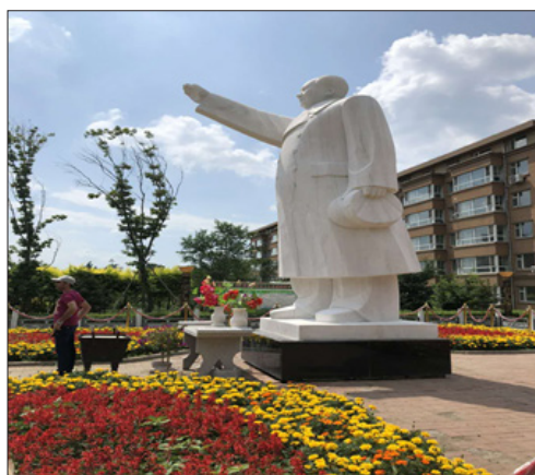
Figure 2: Statue of the great chairman Mao near the greenhouse a small town (Mao Zedong).