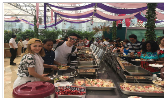
Figure 3: A buffet lunch and refreshment break.