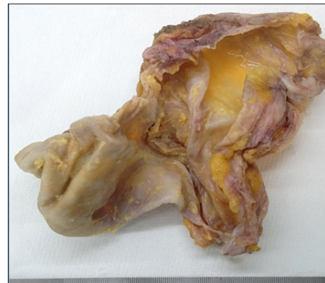
Figure 1: The excised BI-ALCL capsular tissue.

For this reason, the patient underwent first diagnostic dissection of palpable lymph nodes and then to lymphadenectomy and capsulectomy (Figure 1) with extraction of silicone implant and drainage of peri-prosthetic fluid. Histopathologically, clusters of lymphoma cells were present in the peri-prosthetic fluid and in the fibrous capsule surrounding the implant, but not beyond it. The lymph node was characterized by intrasinusoidal infiltrate of highly pleomorphic cells with horseshoe-shaped and simil-Reed-Sternberg nuclei, with prominent nucleoli. The tumour cells were immunohistochemically positive for CD30, CD15, CD4, CD5, Perforin, Granzyme, MUM1/IRF4 and demonstrated negative immunostaining for ALK, LMP1, pan-B-cell and epithelial markers. Others T-cell markers were down regulated.