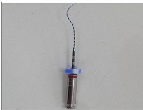
Figure 1: The Austenitic phase shape of the XP file (35°C) (FKG Dentaire, La Chaux-de-Fonds, Switzerland).

antimicrobial, biocompatible, and osteo-inductive calcium silicate-based root canal sealer that is not affected by dentin moisture [8,9]. Previous studies have reported that if the buccal and lingual areas of the canal are clean, the strength of the bond between the root filling material and the root canal walls increases [10]. To the best of our knowledge, no studies have evaluated the effect of the XP file system on the bond strength of root canal sealers. Therefore, the present study was designed to compare the push-out bond strength of root fillings made with either 2Seal or TotalFill BC sealer after the additional instrumentation of oval canals with either the XP or SAF system. The null hypothesis is that the push-out bond strength is not affected by file system or sealer type.