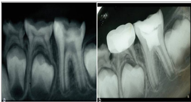
Figure 2: Deep pulpotomy for apexogenesis. a. Extensive carious exposure in an immature mandibular first molar with a history of spontaneous pain. b. After complete caries removal and hemostasis, the radicular pulp is overlaid with mineral trioxide aggregate (MTA).

Nanoscaffolds for pulp regeneration, bioceramics for retrofilling, and repair materials are other applications of nanotechnology in the endodontic treatment (Figure 2). Nanorobots and nanoterminators are also new technologies for local anesthesia with fewer side effects and complications [24]. Nanotechnology has revolutionized all aspects of science and endodontic is no exception. Nano sized particles with significantly superior properties compared to the similar materials at larges scales of measurement have improved the quality of treatment. Understanding of dental tissue at the nanoscale, enabling the precise design of materials and instruments with ultrafine architecture and improving the present techniques in clinical dentistry have significantly promoted the quality of treatment.