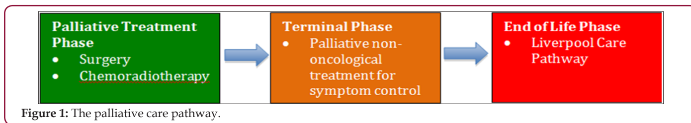
Figure 1: The palliative care pathway.

Excellence (NICE) describes 6 steps for end of life care to ensure all needs of the patient and family are met with co-ordination of relevant services (Figure 2). In the UK, the Liverpool Care Pathway currently guides end of life care.