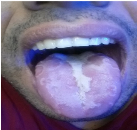
Figure 1: Initial clinical presentation of geographic tongue.

On clinical examination, he was a young male of average built and height with mesofacial profile. TMJ examination and mouth opening were normal. Intraoral examination showed satisfactory oral hygiene with all teeth intact. There were wear facets on lower anterior teeth. Examination of tongue revealed characteristic morphological features of geographic tongue. Multiple flat, smooth, erythematous patches of depapillated mucosa with yellowish white, slightly elevated, irregular peripheral borders were visible on dorsum and lateral margins of the tongue (Figure 1). No ulceration, bleeding or pus discharge was observed. Systemic examinations were unremarkable.