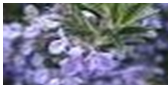
Figure 3: Rosemary Image 2.