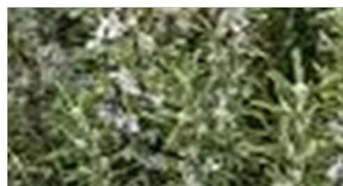
Figure 2: Rosemary Image 1.