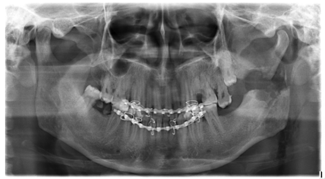
Figure 3: Post operative panoramic radiograph revealing condylar fracture on left side.

bony window was enlarged. During the procedure the mandible fractured inadvertently in the left subcondylar region. After proper debridement the wound was closed with 3'0 black silk suture. Intermaxillary fixation was done with Erich arch bar for a period of 45 days (Figure 3). Intravenous antibiotics and analgesics were prescribed for seven days. Patient was recalled after every week for 60 days. Facial swelling and ear pain on left side was noted during first week which resolved gradually. There was slight paresthesia in the post operative period, which recovered gradually after 2 months. After removal of intermaxillary fixation the patient resumed normal masticatory function after one month.