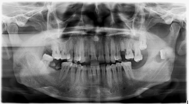
Figure 1: Panoramic radiograph showing impacted ectopic third molar in left side subcondylar region.

A panoramic radiograph was taken showing the lower left third molar to be located in the subcondylar region. The impacted tooth was well formed and the crown was surrounded by radiolucent area. The ectopic impacted tooth was horizontal in position with its root apices positioned towards posterior border and crown towards the anterior border (Figure 1). According to the orientation and location of the impacted tooth it was considered as an ectopic impaction of mandibular third molar. Surgical procedure was performed under local anaesthesia, with inferior alveolar nerve block, lingual, long buccal and local infiltration. Intraoral access was selected using ward's extended incision giving exposure to the buccal and lingual surface of angle and ascending ramus. Coronoid process was located and exposed (Figure 2). The tooth was completely surrounded and covered with bone.