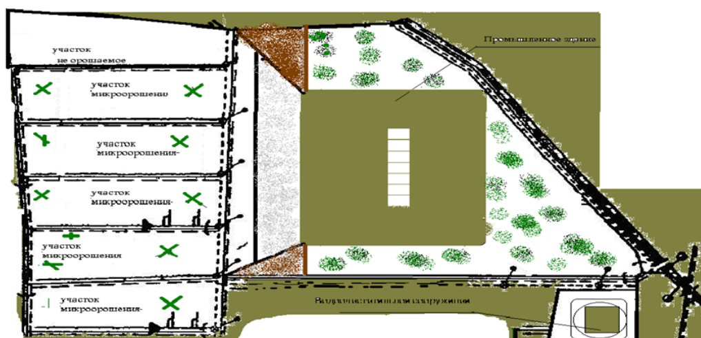
Figure 1: Scheme of the irrigation sprinkling station on the experimental part of the Tertersky RWCN in the Garabagh land in the period 2006-2010 with the use of the Idad and MDR sprinklers.

It was found that at irrigation rates of 300-420 m 3 / ha the soil is soaked to insignificant depth (20-30, sometimes up to 40 cm). The low absorption rate of the upper soil layer and large slopes provided a significant surface discharge (30%), increasing from irrigation to irrigation. The addition of moisture in the soil was only 100-300 m 3 / ha. Small irrigation rates require private watering (after 5-6 days). The supply of large irrigation norms (600-700 m 3 / ha and more) is difficult due to a mismatch in the intensity of the rain (2-3 mm / min) and the rate of water absorption into the soil.