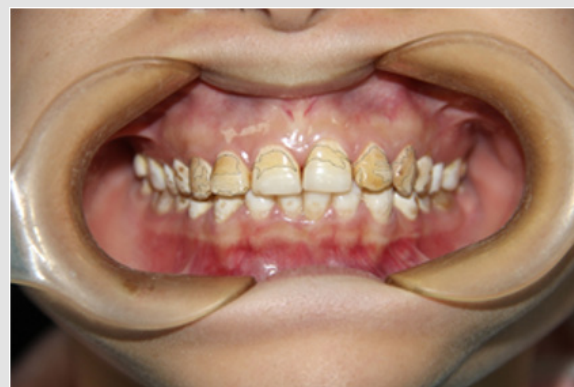
Figure 1: Calculation of the discolored area using the software (PhotoShop; discolored area 40.04%).

2018, 72 patients with dental fluorosis at our Hospital were enrolled for the study. All patients signed informed consents. The inclusion criteria were as follows: age 18–50 years; diagnosis of fluorosis using the modified Dean's index criteria with a range of 0 (normal), 0.5 (questionable), 1 (very mild), 2 (mild), 3 (moderate), and 4 (severe) [11]; fluorosis Dean's grading 3 and 4; no dental caries and periodontitis; good oral and general health; no mental disorder; no large area filling and crown restorations; and patients' informed consent for treatment. The exclusion criteria were as follows: pregnant and lactating women; allergy to test products; and structural cracks on the enamel surface. A total of 60 patients were enrolled according to the screening criteria. A blinded evaluator recorded the patient's tooth staining using a digital camera (Canon EOS 600D, Tokyo, Japan) with a lens (Canon EF, 100mm) of the same shutter speed (1/200) and the aperture (F/11) in the indoor natural light. The camera was placed directly in front of the patient, and the lens was perpendicular to the maxillary incisor lip surface. The area of tooth staining and the total area of six maxillary anterior teeth were measured using image software (Figure 1).