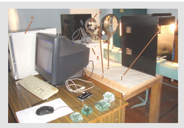
Figure 2: Laboratory stand for measuring glass transmittance. 1-halogen lamp with a power of 300 W, 2- lens for parallelization of the radiant flux, 3-sample - glass, 4-receiver - actinometer AT 50, 5- voltage stabilizer, 6-computer.