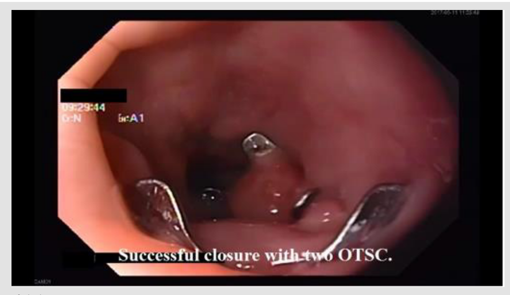
Figure 2: Successful closure using 2 OTSCs.