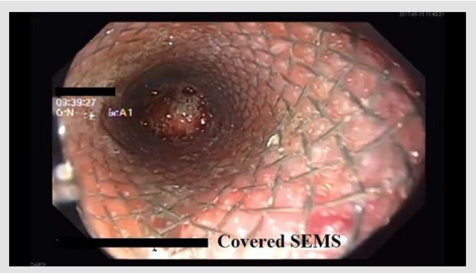
Figure 4: Covered SEMS at the level of the clips.