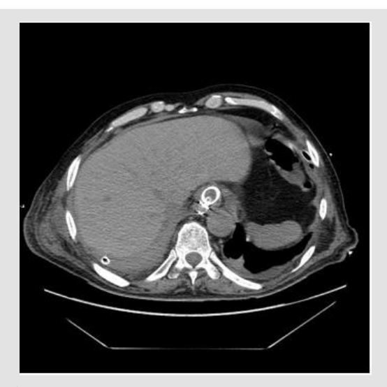
Figure 5: Follow up CT-scan on the 13<sup>th</sup> day showing almost complete resolution of the pleural effusion.