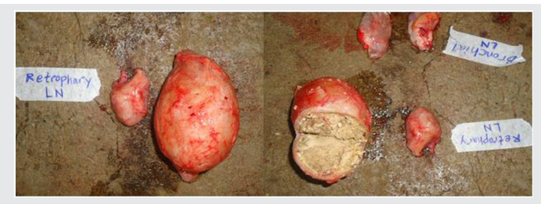
Figure 3: Enlarged and mass of calcified retrophayngeal lymph node of investigated camel.

Postmortem examination was performed following the procedure as previously described [9,21]. Tissues from the lung, lymph nodes such as sub-mandibular lymph node, retropharyngeal lymph node, trachea-bronchial lymph node, cranial and caudal mediastinal lymph node were examined in detail under a brightlight source. The lobes of the left and right lungs were inspected and palpated externally. Then, each lobe is sectioned into about 2cm thick slices to facilitate the detection of lesions with sterile surgical blades. Similarly, lymph nodes were sliced into thin sections (about 2mm thick) and inspected for the presence of visible lesions. The cut surface was examined under a bright light source for the presence of abscess and tubercle lesions [9,22]. Camels with macroscopic lesions varying from firm or hard white, grey, or yellow nodule with a yellow, caseous, necrotic centre that was dry and solid to thin walled suppurative abscesses were classified as post mortem positive [23]. Whenever gross lesions suggestive of TB were detected in any of the tissues, the tissues were classified as having lesions (Figure 3).