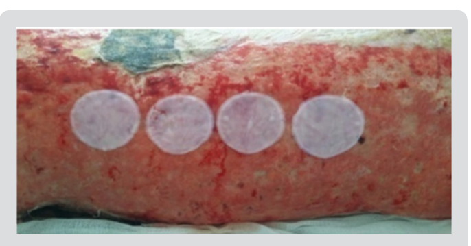
Figure 1: Four ActivSkin® human tissue engineering skin patches were transplanted on the granulation wound.

Considering the extent of his burn injury, donor sites were insufficient, his left lateral thoracic wound were subjected to escharotomy to expose the granulating wound during Week 4 after the injury and four active human tissue engineering skin patches (20cm<sup>2</sup>/patch, Shaanxi Aierfu Tissue Engineering Company Limited, lot number: 140702) were grafted (Figure 1). Biopsy was performed on the same day of the grafting surgery and the result images were taken. The graft survivals were observed and imaged at 2<sup>nd</sup>, 3<sup>rd</sup>, and 4<sup>th</sup> week after the surgery (6<sup>th</sup>, 7<sup>th</sup>, and 8<sup>th</sup> week after the injury) along with biopsies. Hematoxylin-eosin (HE) staining was performed to observe the skin survivals. To further confirm that the grafts stayed on the wound, during week 7 after the surgery (week 11 after the injury), the healed skin tissues and oral mucosa from the patient were collected and sent to Zhejiang Dian Forensic Center for DNA homology test (Figure 2A). The test protocol was as below: DNA was prepared using Chelex method and amplified using the accredited Goldeneye 20A system. The amplicons were separated using the ABI-3000 electrophoresis system and the genotyping results were laser-scanned and analyzed.