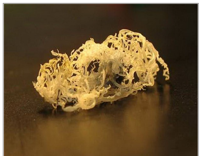
Figure 2: Vascular tree of rat's brain (perfusion of Protacryl-M, cold-setting adhesive, was done by Senior Scientist Margarita Dosina in anesthetized rat via catheter placed into internal carotid artery).

The nature is unable to put into words indignation at irrationality of human actions. But the consequences of adding an additional insensitive element into classic scheme of respiratory homeostasis control [10,11] are obvious for living organism. Significance of signals incoming from vascular interoreceptors [1] is substantiated by the fact (Figure 2).