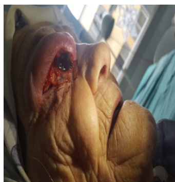
Figure 4: Ulcerated mass.