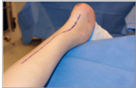
Figure 2: The planned incision of one case.