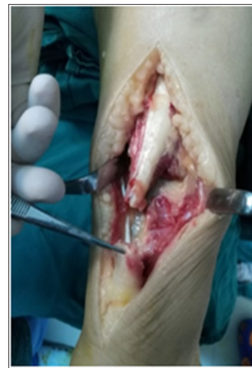
Figure 3: The gap of ruptured tendon after debridement.