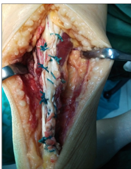
Figure 6: The proximal stumps are repaired to each other with Krackow method and plantaris used to augment the repair.