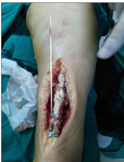
Figure 5: The proximal and distal ends are repaired by Krackow method and plantaris tendon was harvested.

centered over the site of the rupture (Figure 2). All scar tissues were debrided, keeping surrounding tissues and approaching healthy margins of the Achilles tendon, and exploration of plantaris tendon is performed. The gap between both ends was measured with the ankle at 30 degrees planter flexion after debridement and excision of scar tissues were 5-7 cm (mean 5.6 cm) (Figure 3). An inverted V shape incision was done in the proximal tendinous portion of the proximal stump; the length of the limb is 1.5 times the length of the gap (Table 1) (Figure 4). The proximal stump is pulled down, with the ankle in 30 degrees planter flexion and repaired to the distal stump with Krackow method using non-absorbable sutures (Demo-bond no 5). Then the plantaris was harvested using tendon stripper and used to augment the repair (Figures 5 & 6) Closure of the wound and above knee cast in 20 degrees planter flexion was applied.