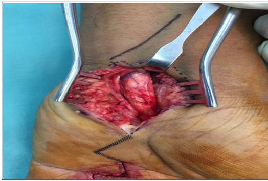
Figure 2: Classical carpal tunnel release done-noted whitish chalky infiltration of the tendon of the FDS, synovial adhesion to other tendons and hypertrophy of the flexor tendon.