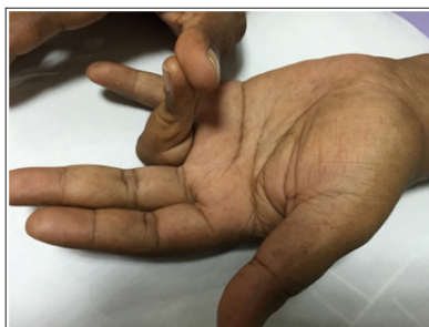
Figure 1: (Volar view): The ring finger in flexed position.

Gout is an inflammatory arthritis caused by cellular deposition of monosodium urate crystal [1]. Tophi are chalky, gritty accumulations of monosodium urate crystals that build up in soft tissue in an untreated gouty joint [1]. The peak incidence of gout is between the ages of 30-50 with the prevalence increasing with age [1]. Gout is five times more common in men [1]. Tophi can present as a first sign of hyperuricemia but reports on the involvement of the flexor tendons of the hand is rare [2]. Although tuberculous tenosynovitis is a more common etiology for swelling over the wrist, gout must be among the differentials irrespective of hyperuricemic status. It can present clinically as tendon rupture, nerve compression, or digital stiffness and can be complicated with infection. Because of its low frequency, gouty involvement of the flexor tendons is not often considered in the differential diagnosis of tenosynovitis [2]. We report a rare case in which intratendinous tophaceous gout was found within the flexor digitorum superficialis tendon at the wrist causing patient to have trigger finger like symptoms.