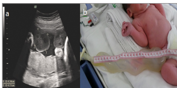
Figure 1: a. Prenatal ultrasonography image in the 34th week of gestation showing the dilated umbilical cord with edema and b. Postnatal findings of the neonate with a diffuse giant umbilical cord.

cystic changes in the umbilicus, and chromosomal examination of amniotic fluid conducted in the 20 th week of gestation showed 46, XY, inv (9) (p12q13). However, fetal development was progressing successfully. At delivery, the infant presented with a diffuse giant umbilical cord measuring 25cm in length and cm in diameter with a glistening surface and hydropic consistency (Figure 1). No abdominal contents were noted within the cord. The cord was clamped approximately 30cm from the abdominal wall, where it became thinner. Ultrasonography conducted when the infant was 2 days old showed a probable connection between the umbilicus and bladder, which was confirmed by a fistulogram.