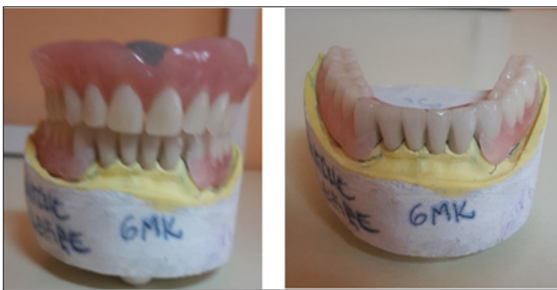
Figure 3: Aspects of maxillary complete denture and partially mandibular removable.