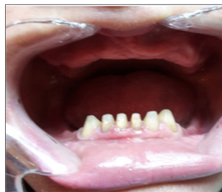
Figure 2: Aspect of preparation of the teeth at the mandibular level.